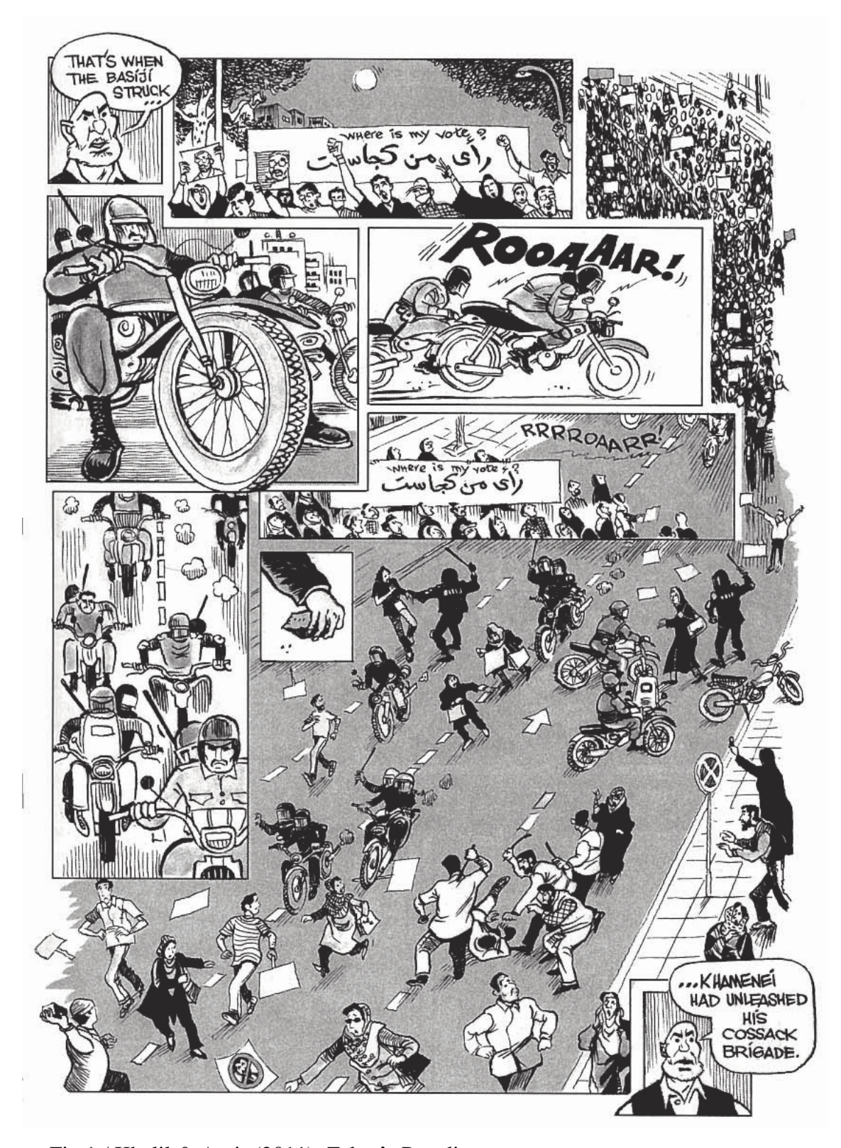
Fig.1 / Khalil & Amir (2011): Zahra's Paradise.