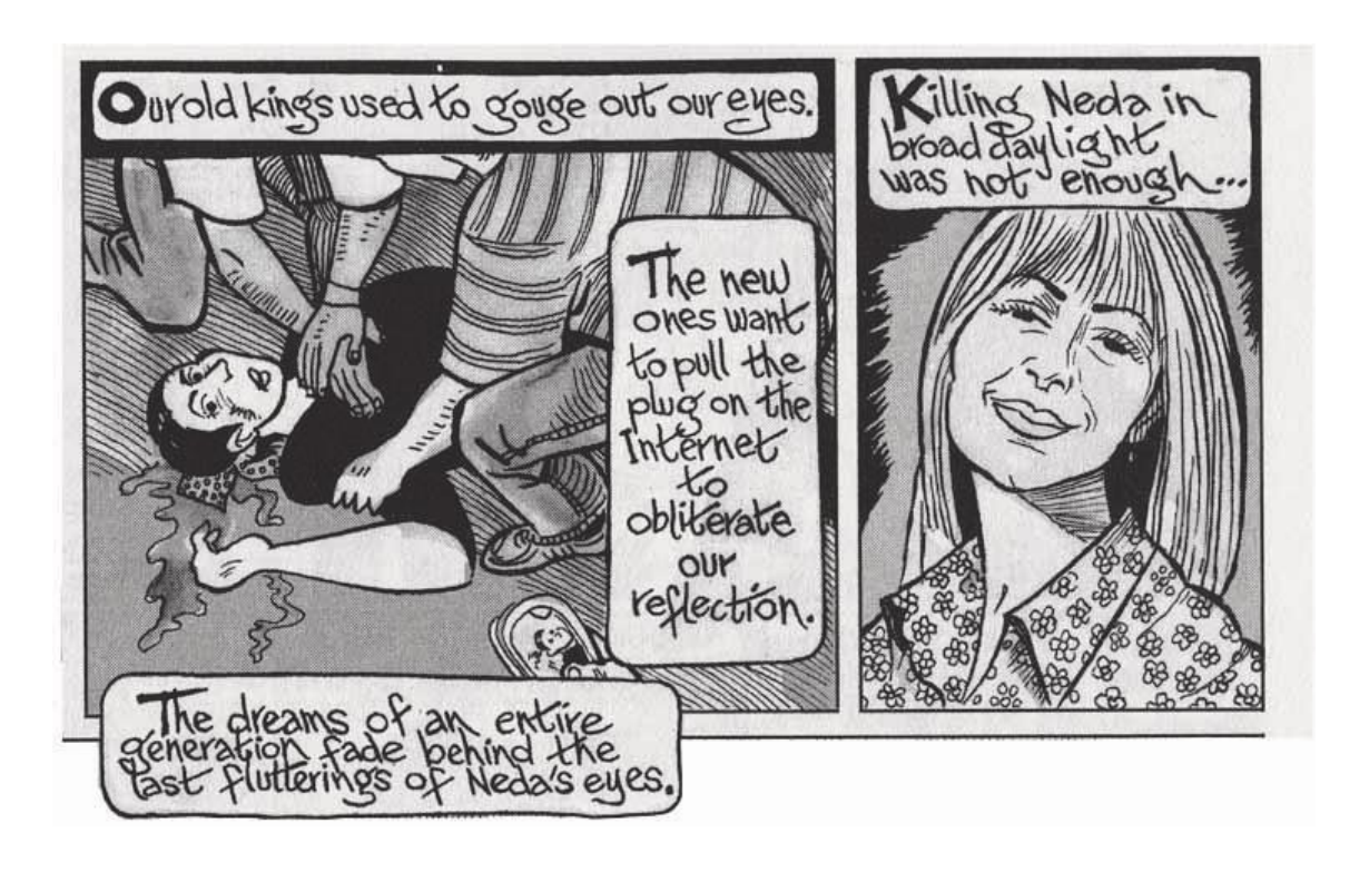
Fig.2 / Khalil & Amir (2011): Zahra's Paradise.