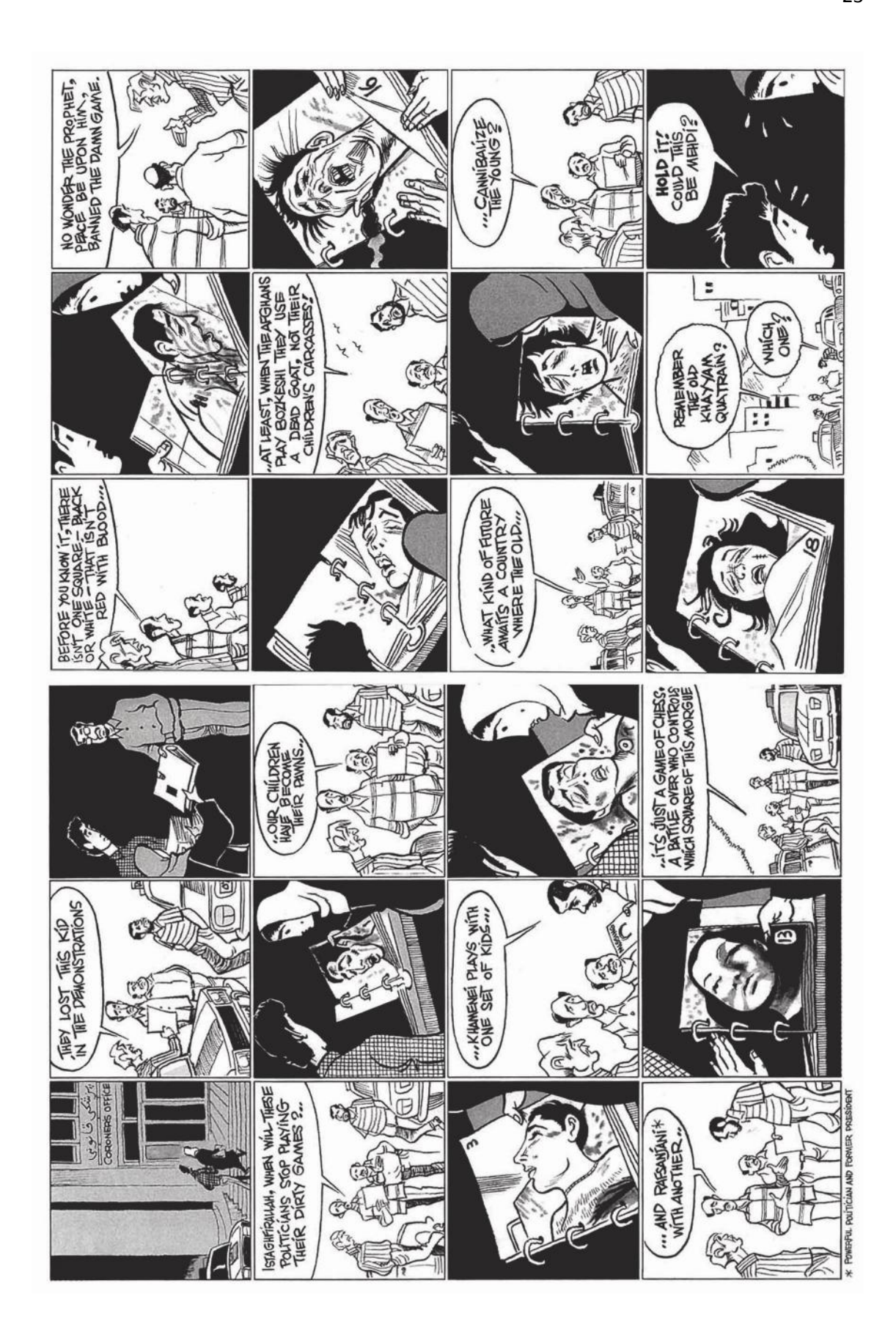
Fig.4 / Khalil & Amir (2011): Zahra's Paradise.