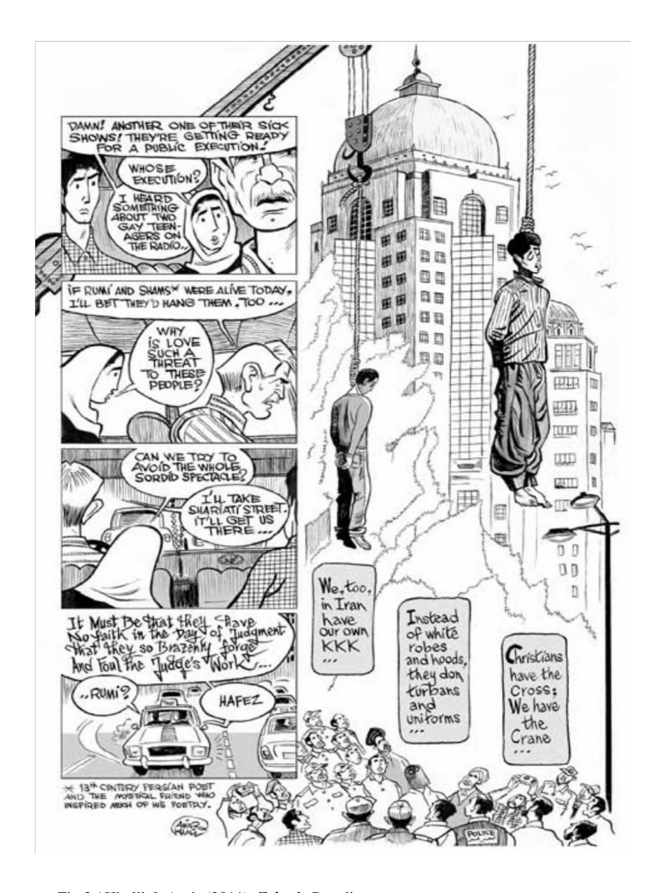
Fig.3 / Khalil & Amir (2011): Zahra's Paradise.